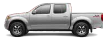
PRO-4X: KING CAB AND CREW CAB