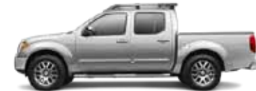
SL: CREW CAB