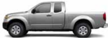
S: KING CAB AND CREW CAB