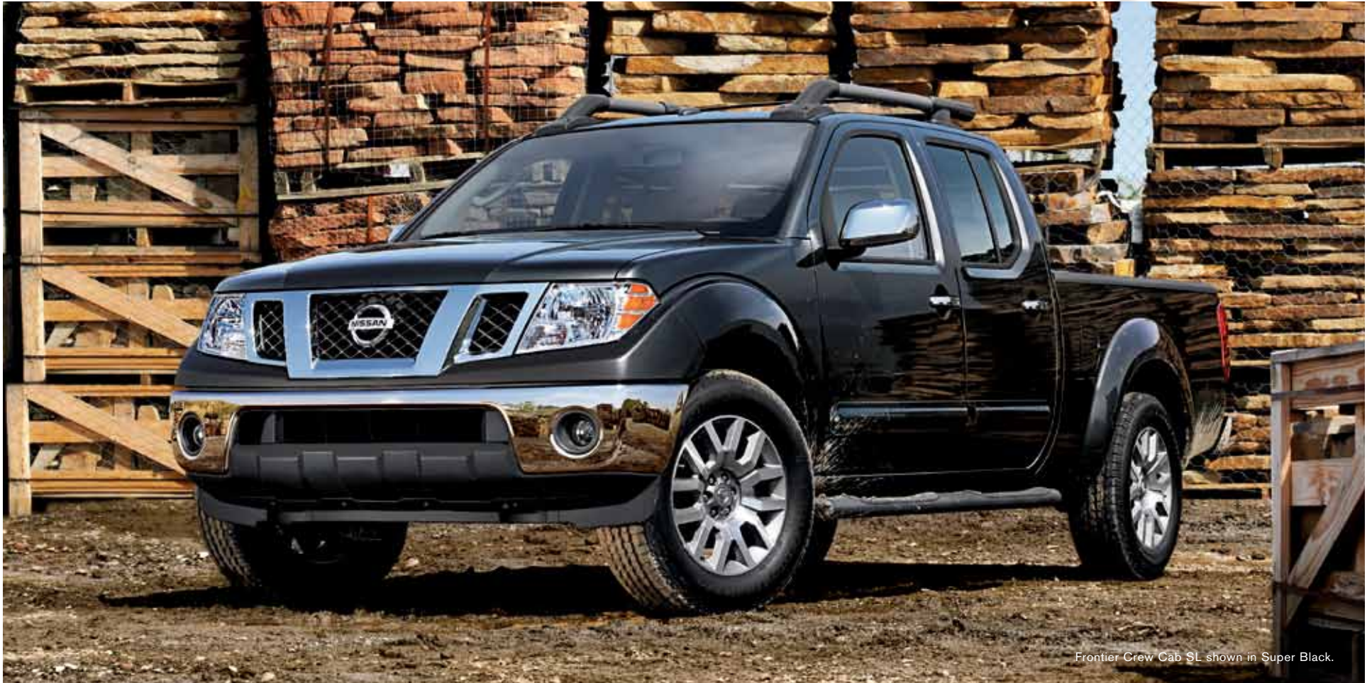
Frontier Crew Cab SL shown in Super Black.