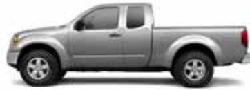
SV: KING CAB AND CREW CAB